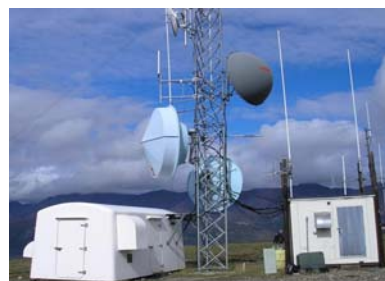
Photo of Reindeer Hills taken on August 21, 2007. The ARRC building houses Department of Defense - US Army Alaska equipment, and is located on the Parks Highway between Talkeetna and Clear.

Website: http://www.ak-prepared.com/almr/